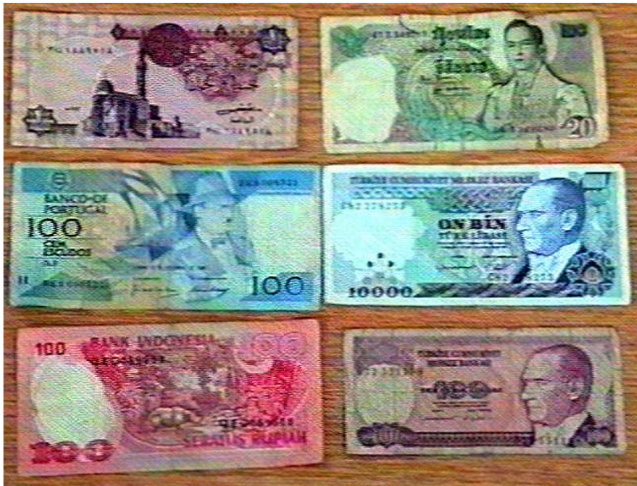
Currency from different countries which founded at battle field in Bosnia