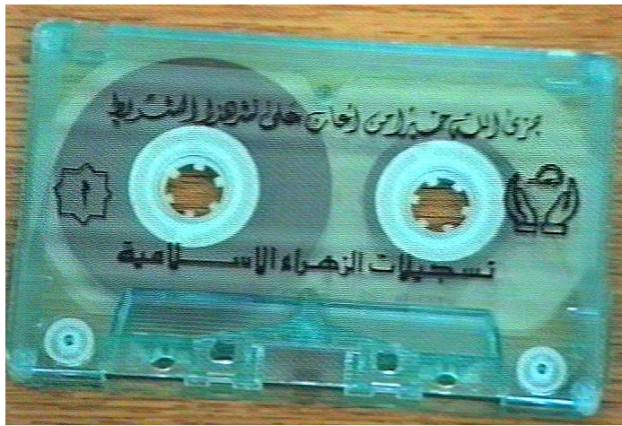
audio tapes on arabic